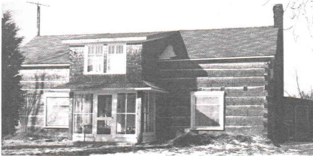
Leavens/Hitchon House, near Bloomfield: highly refined log construction.